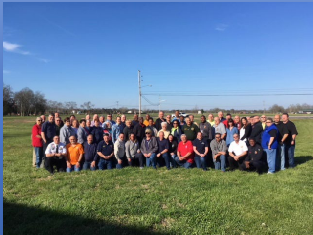
2019 – initial training academy